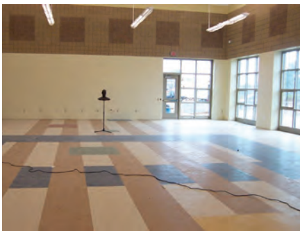
ACOUSTICAL TESTING PROCESS